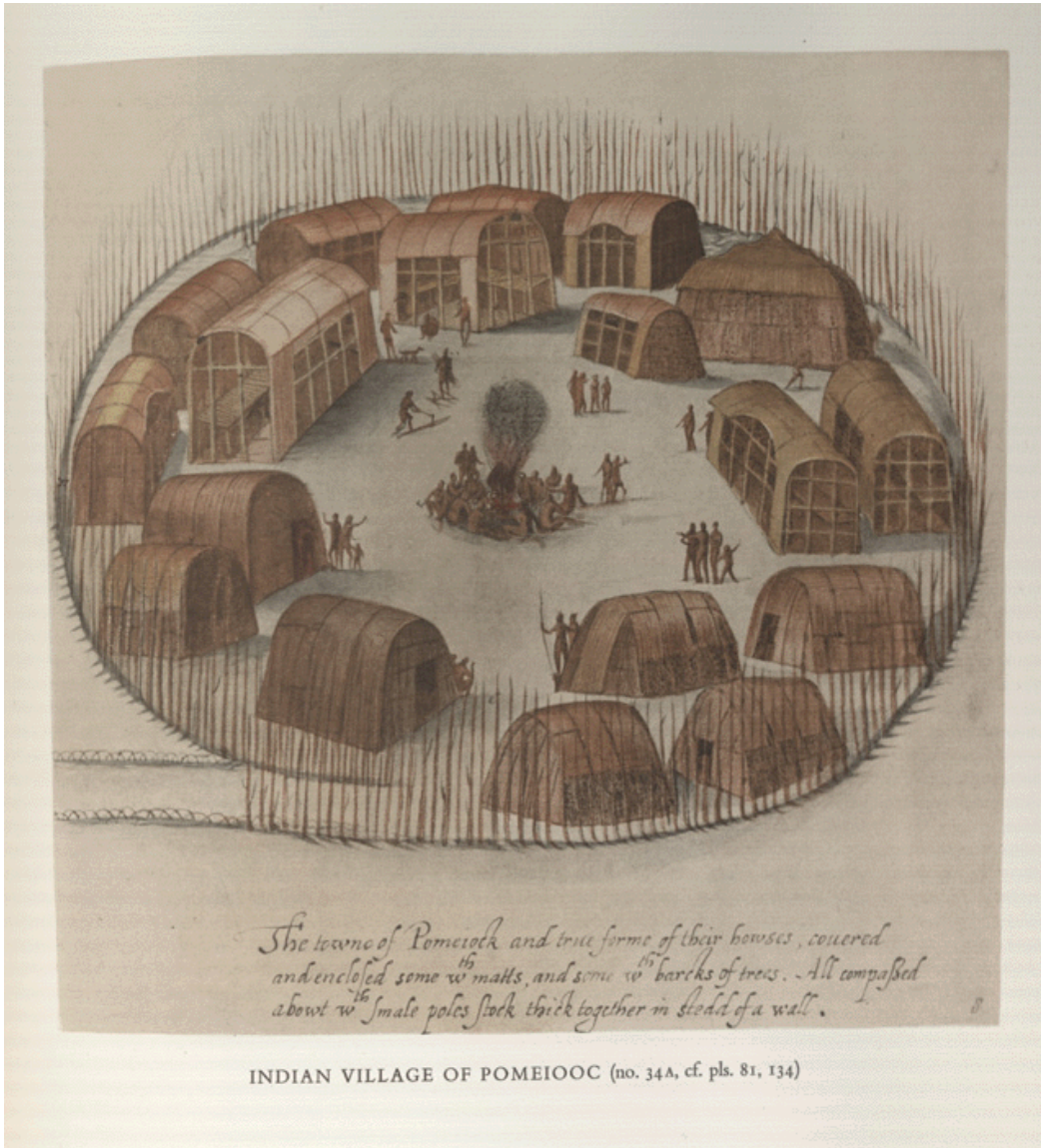
INDIAN VILLAGE OF POMEIOOC (no. 34A, cf. pls. 81, 134)

John White, "Indian Village of Pomeiooc" (1585-1586), British Museum.